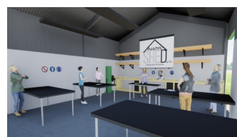
Interior Design Plan

what has been such a long process. We want to thank